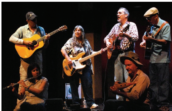
The Ashley Gang

Gang has been performing together for more than a decade.